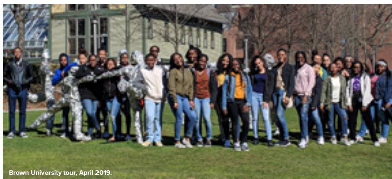
Brown University tour, April 2019.

Due to federal guidelines, household income and parental information is required for the completed application. Eligibility criteria is established by the U.S. Department of Education.